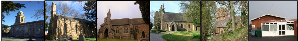
St Mary Magdalene SS Peter + Paul St Calixtus St Nicholas St Mary Magdalene St Leonards Hall Bridgnorth Tasley Astley Abbotts Oldbury Quatford Bridgnorth