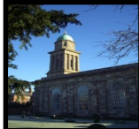
St Mary Magdalene Bridgnorth