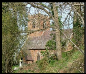
St Mary Magdalene Quatford