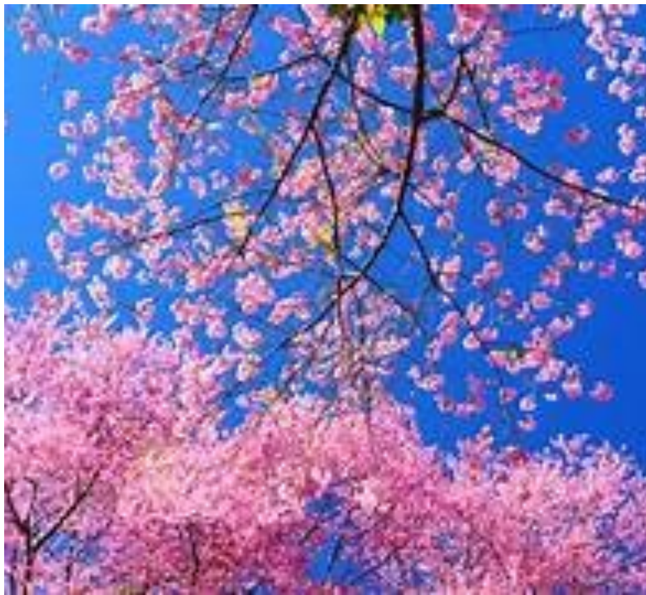
Bridgnorth St James' Hall