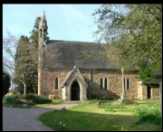
St Nicholas Oldbury