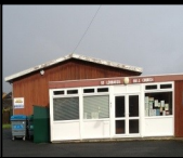
St Leonards Hall Bridgnorth