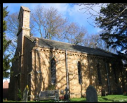
SS Peter + Paul Tasley