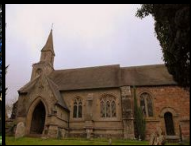
St Calixtus Astley Abbots