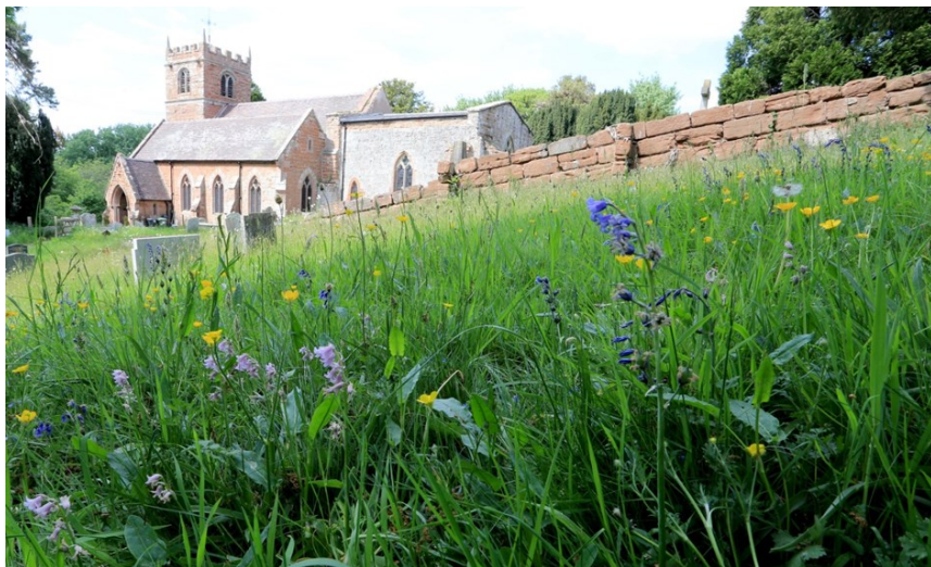
Wildflowers in our churchyard, just before the sheep returned for a fortnight to control the grasses

Everyone is welcome and we love to see the church packed full.