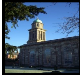
St Mary Magdalene Bridgnorth