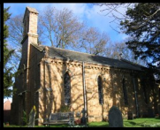
SS Peter + Paul Tasley