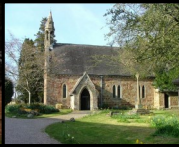
St Nicholas Oldbury