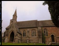
St Calixtus Astley Abbotts