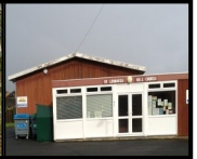
St Leonards Hall Bridgnorth