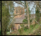
St Mary Magdalene Quatford