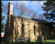
SS Peter + Paul Tasley