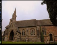
St Calixtus Astley Abbots