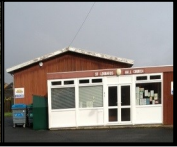
St Leonards Hall Bridgnorth