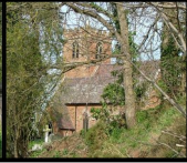
St Mary Magdalene Quatford