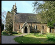
St Nicholas Oldbury