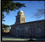
St Mary Magdalene Bridgnorth